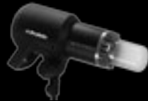
Profotungsten Air 500 W and 1000 W