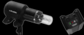
ProDaylight Air 400 W and 800 W