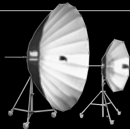
The line of Profoto Giant Reflectors consists of the the parabolic Giant Reflectors Giant Reflector 180 (180cm) 10 03 18 Giant reflector 240 (240cm) 10 03 19 Giant reflector 300 (300cm) 10 03 20 plus the Giant Silver 150 cm – 10 03 16, and Giant Silver 210 cm – 10 03 17. Optional front diffusers are available for all Giants.